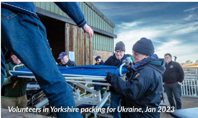
Volunteers in Yorkshire packing for Ukraine, Jan 2023