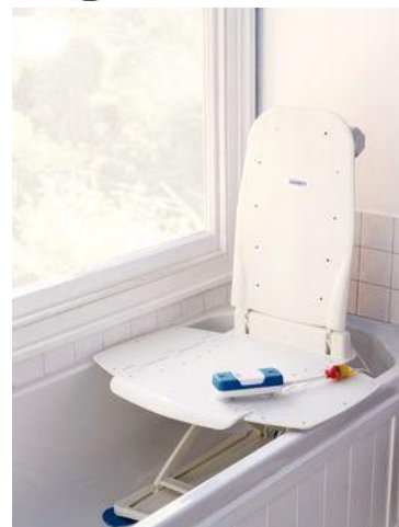
Bath lift(battery operated)