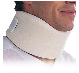
Hard /soft cervical collars