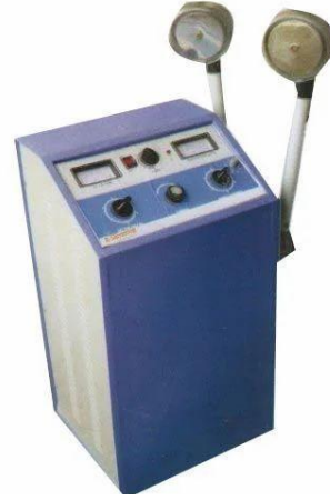
Electrotherapy (SWD, interferential, ultrasound)