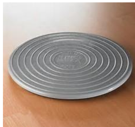
Turning circle- rotating disc – often used with handling belt.