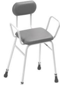
Perching stool- has a sloping seat to enable everyday tasks while sitting