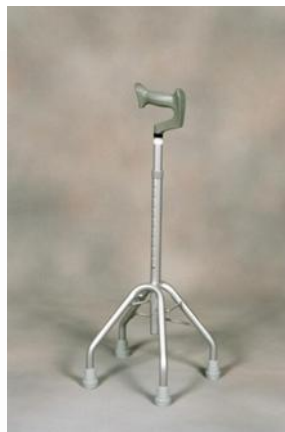
Tripods and quadrapods- adult