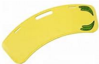
Banana board- chair to chair self transfer