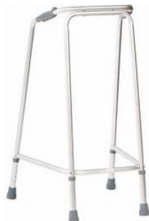
Walking frame (zimmer)