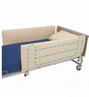
Cot sides covers