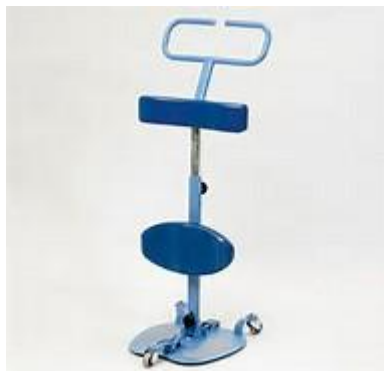
Turning device- rotating disc with hand grips