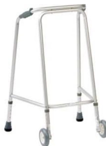
Walking frame with wheels