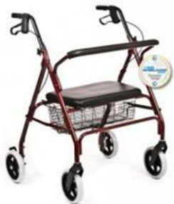
Adult walker 3 or 4 wheels